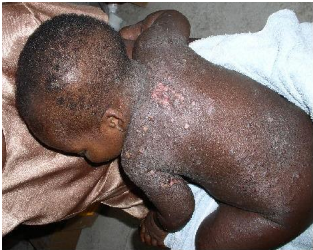
A baby infected with scabies